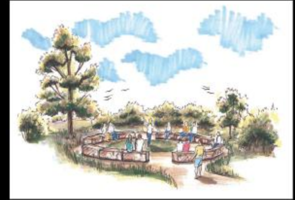
GATHERING COUNCIL RING PERSPECTIVE nts