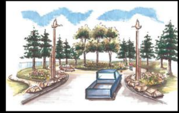
ENTRY MONUMENT PERSPECTIVE nts