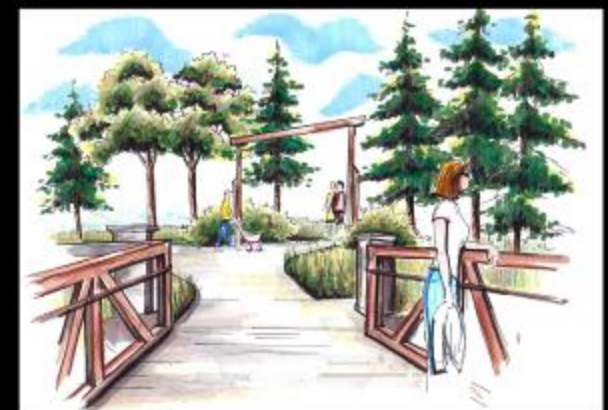
PEDESTRIAN BRIDGE PERSPECTIVE nts