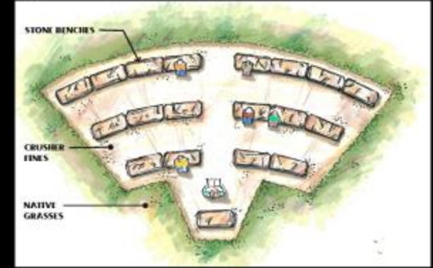
CREEK SIDE OUTDOOR CLASSROOM PLAN VIEW nts