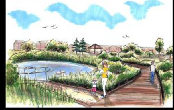
CREEK SIDE BOARDWALK PERSPECTIVE nts