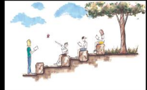
CREEK SIDE OUTDOOR CLASSROOM SECTION nts