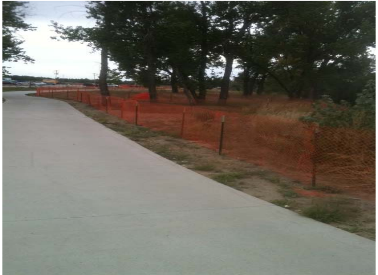
Cherry Creek Regional Trail looking south #3

Fiore will continually keep the trail free of construction debris.