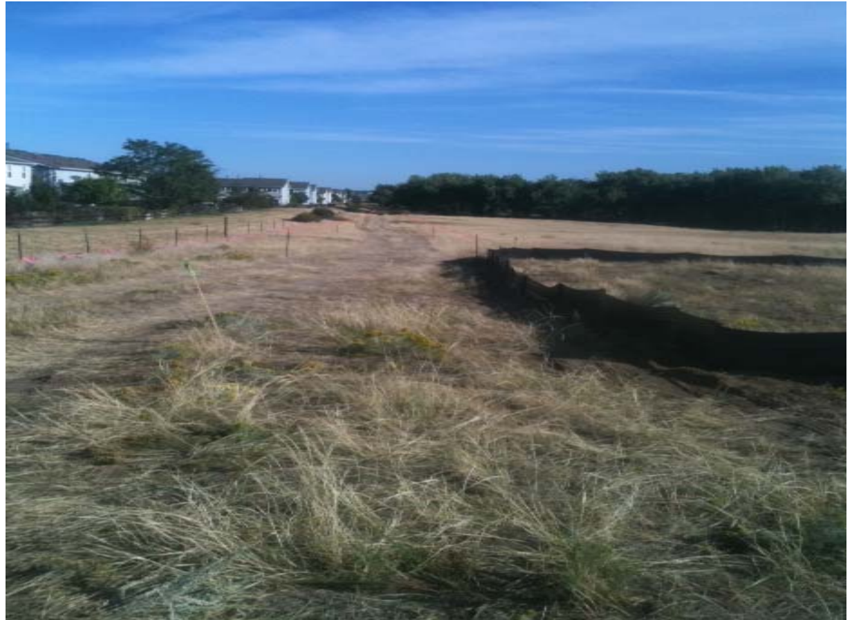
Western Haul Road looking north

Access to/from this haul road is off of E. Nichols Avenue in SouthCreek.