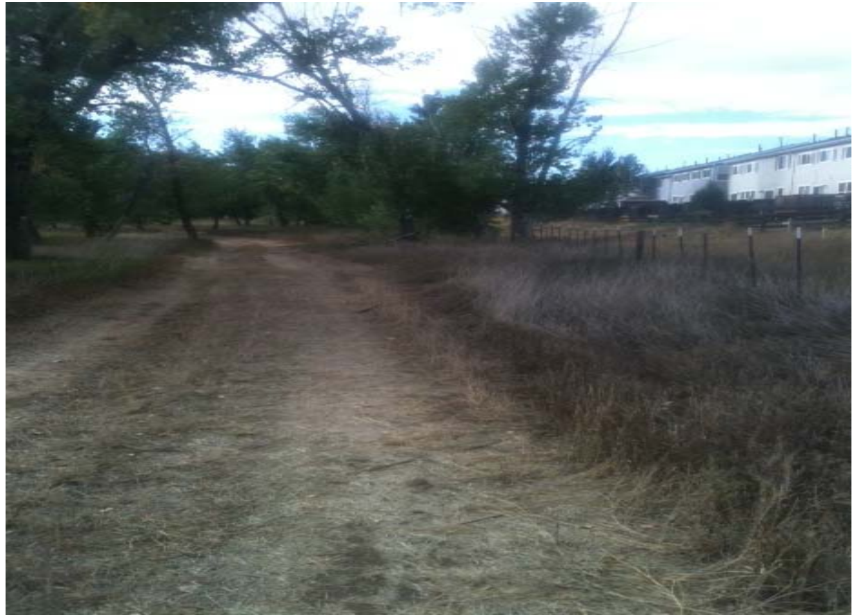
Western Haul Road looking south #2

The barbed wire fence on the right side of this photo will remain in place throughout the project, but will come down once the heavy construction is complete.