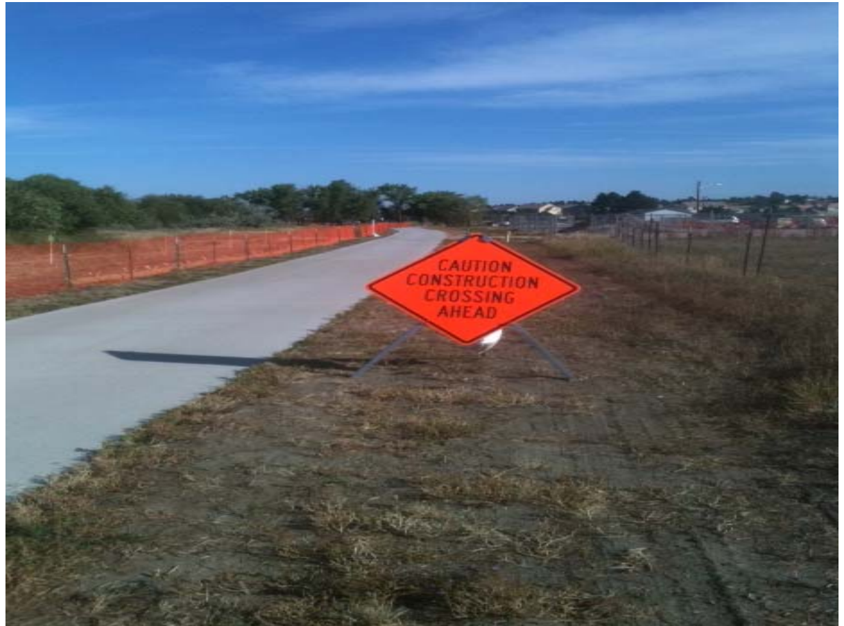
Cherry Creek Regional Trail looking north

Appropriate signage is or will be in place as construction traffic begins.