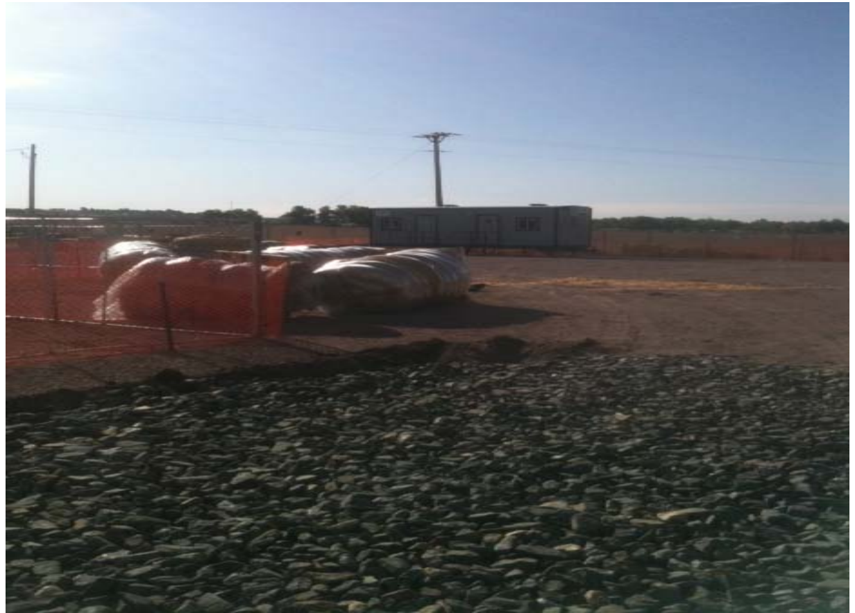
Straw Waddles within the Tagawa Staging Area