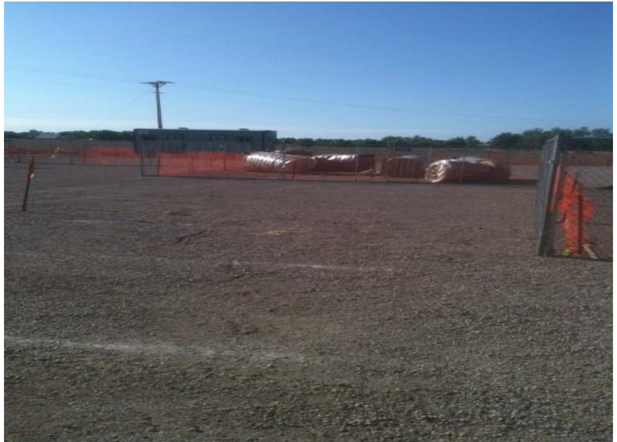
Staging Area within Tagawa's

A construction trailer equipped with heat & air conditioning for use by the contractor and others.