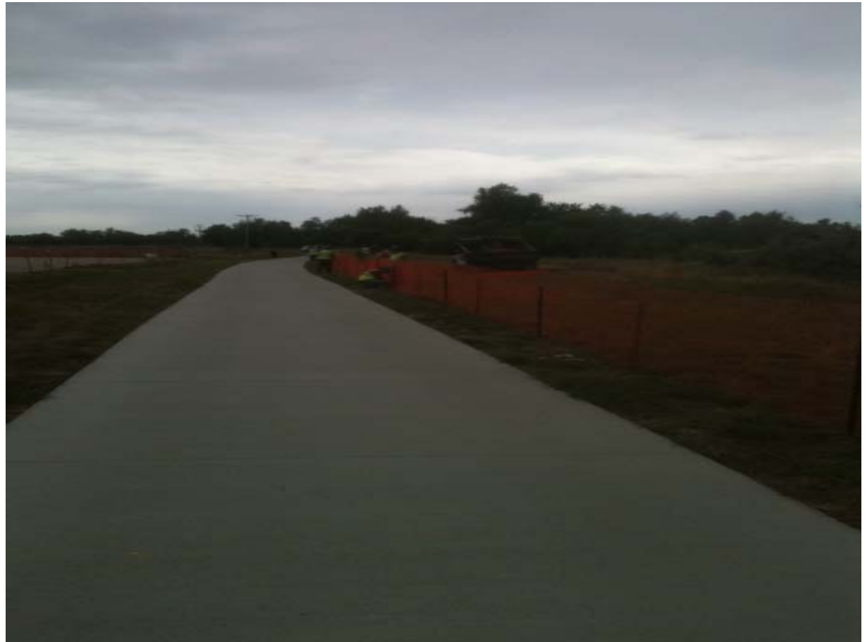
Cherry Creek Regional Trail looking south #2

We anticipate only needing one construction crossing of the CCRT (coming out of the Staging Area.