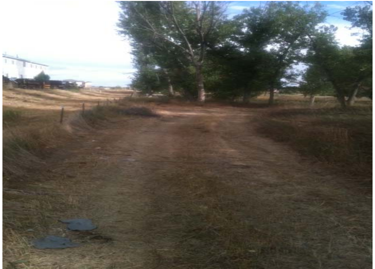
Western Haul Road looking north #2

Minor field modifications have been made, with approvals from the necessary agencies, in order to allow as many trees to remain as possible.