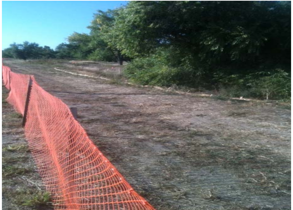
Eastern Haul Road

This haul road is parallel to the Cherry Creek Regional Trail.