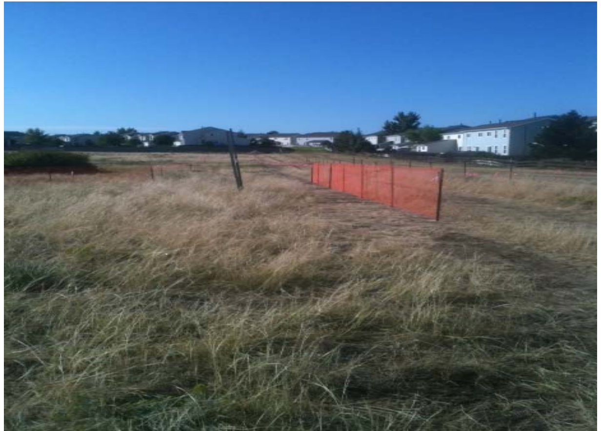
Western Haul Road looking south

E. Nichols Avenue is immediately to the right.