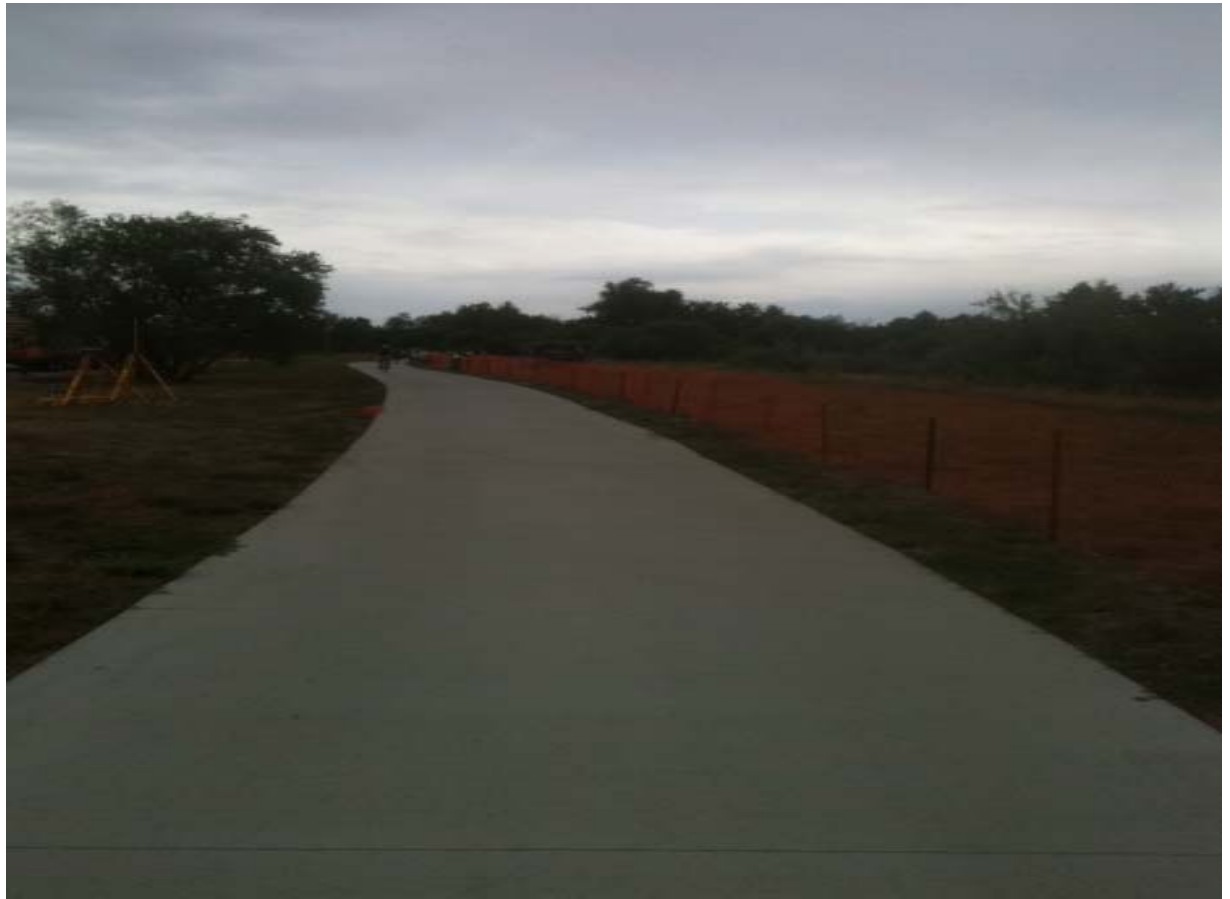
Cherry Creek Regional Trail looking south

Construction fencing exists along the west side throughout the entire trail to provide a safe environment for the public.