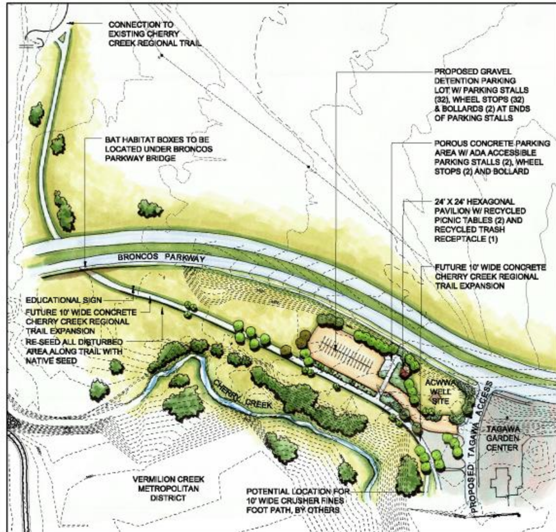
OVERALL MASTER PLAN

PREPARED FOR: ARAPAHOE COUNTY ARAPAHOE COUNTY WATER AND WASTE WATER AUTHORITY CITY OF CENTENNIAL PARKER JORDAN METROPOLITAN DISTRICT TAGAWA GARDEN CENTER VERMILION CREEK METROPOLITAN DISTRICT