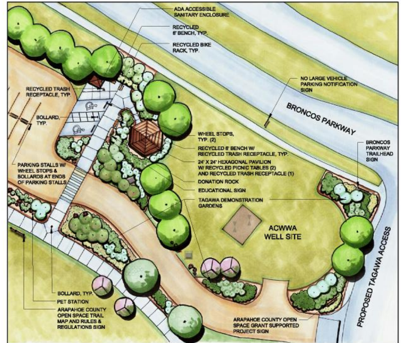
TRAILHEAD AMENITIES DETAIL PLAN